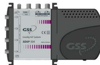
Multiswitch for 4 receivers SDSP 504

SDSP 504 SDSP 506 SDSP 508 SDSP 512 SDSP 516